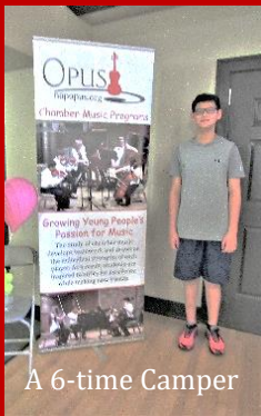
A 6-time Camper