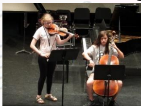
Composition (above) Videography

Develop your own creativity and stretch your musicality by making connections with the arts you love!