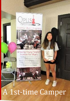
A 1st-time Camper

OPUS focuses on Chamber Music. Ensembles of 3 to 6 players receive their chamber and orchestra music weeks ahead of the camp to begin practicing.