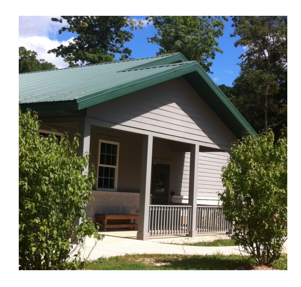
Q: Will there be overnight parking available?

A: There is limited overnight parking available. An overnight parking request form is available to download and print from your member page at <a href="http://members.eyso.org">http://members.eyso.org</a> Please fill out the request form and present to staff at check-in.